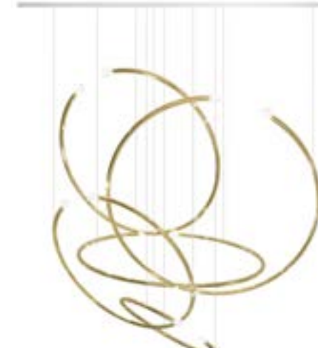
J.CHA-O-RING OSAKA O Ring suspension lamp with 10 lights. Structure in brass. Gold finishing. Upper round plate included. ø 210 x h 230 cm