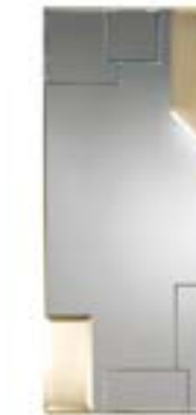
J.DEC-12 DECÒ Mirror with structure in brass and bevelled mirrors. LED lighting. 82 x 3 x h 190 cm