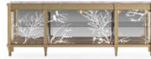
J.FUJ-11 FUJI Sideboard with structure in metal with gold finishing. Top in white Namibia Rhino marble. Engraved glasses with Oriental decorations. Interior with back in mirror and glass shelves. Lighting system. 258 x 60 x h 91 cm