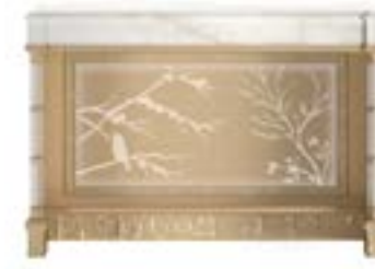
J.FUJ-27 FUJI Bar counter with structure in metal with gold finishing. Top in white Namibia Rhino marble. Engraved glasses with Oriental decorations. Lost-wax cast brass decorative elements and crystal columns. Lighting system. 170 x 80 x h 115 cm