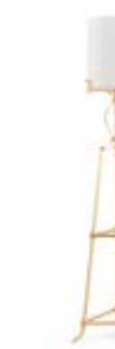
J.CHA-SEL SELENIA Floor lamp with structure in brass with gold finishing. Shade in white satin. ø 36 x h 187 cm