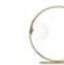
J.CHA-SPIRITOS SPIRITOS Table lamp in brass. Opaline glass light bulb. ø 50 cm