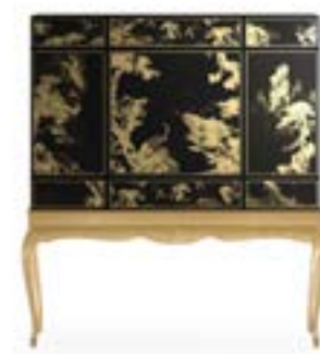
J.BRC-133 BROCART Bar cabinet with base in wood, hand-carved legs and decorative frame finished in patinated antique gold. Structure in black lacquered wood with gold leaf laser engraved oriental decoration JG302. Two doors and three drawers with inner cover in microfiber. Central door and internal compartments with glass shelves and brass railing for glasses and bottles. Back covered in antique mirror. 171 x 56,5 x h 180 cm