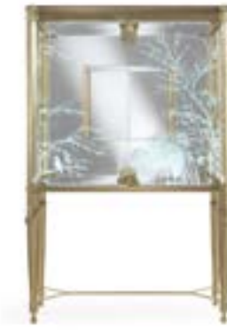
J.FUJ-13 FUJI Showcase with structure in metal with gold finishing. Engraved glasses with Oriental classical decorations. Interior with back in mirror and glass shelves. Lighting system. 138 x 50 x h 210 cm