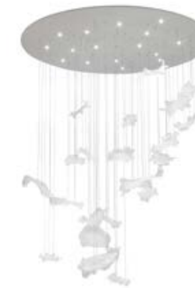
J.CHA-FBU-200 FEUILLE Chandelier with suspended decorative elements made in Murano glass with craquelé effect. Ceiling rose in white metal with n. 16 spotlights. ø 200 x h 150/250 cm