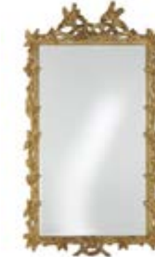
J.CHAB-12 CHABLIS Mirror with structure in hand-carved beechwood finished in gold with patina J2910. Bevelled mirror. 107 x h 185 cm