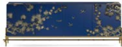
J.SHE-11 SHERAZADE Sideboard with wooden structure laquered blue with gold decoration. 255 x 50 x h 90 cm