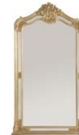
J.CHN-29 CHAINE Mirror with frame in hand-carved beechwood with gold leaf finishing J2880. Natural mirror. 132 x h 235 cm