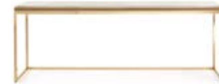
J.DED-21 DEDALUS Console with structure in brass with glossy finishing. Engraved frame. Top in white Namibia Rhino marble. 223 x 43 x h 87 cm