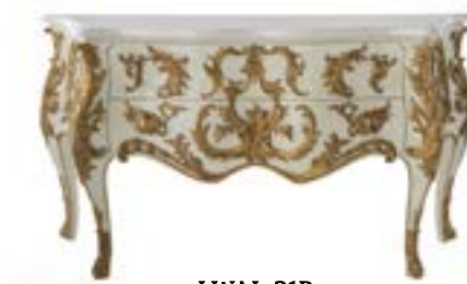
J.WAL-21B WALLACE Chest of drawers with structure in wood with cast brass decorative elements. Top in white Namibia Rhino marble. White lacquered finishing with patina and gold leaf details JG303. Two drawers with inner cover in microfiber. 183,5 x 62 x h 95 cm