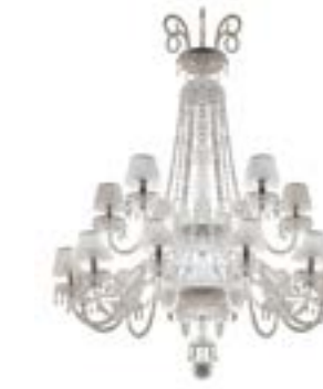
J.CHA-CRYS-333 CRYSTAL Chandelier 12+6 lights. ø 110 x h 160 cm