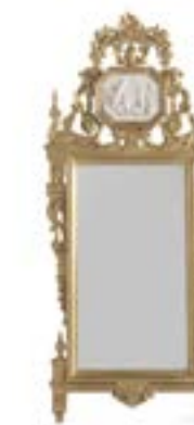
J.INT-12 INTRIGUE Mirror with structure in hand-carved wood with gold leaf finishing J2880. White lacquered bas-relief. 85 x 6 x h 195 cm