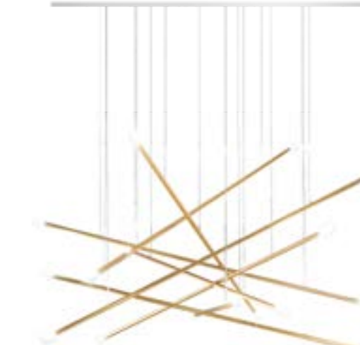
J.CHA-URA/16 URANIA Ceiling lamp with 8 brass tubes and 16 lights. Ceiling rose in white metal. ø 255 x h 100/200 cm